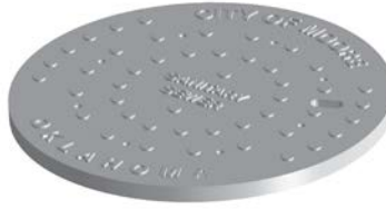
City Of Moore