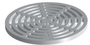
Type M Grate Approx. 205 sq. in. open area