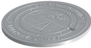
City Of Ardmore Logo