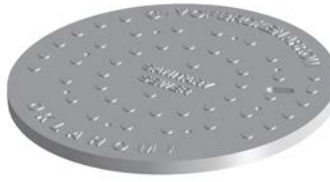
City Of Broken Arrow