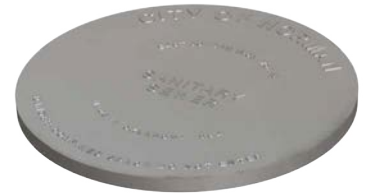
City Of Norman