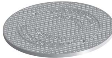
City Of Tulsa