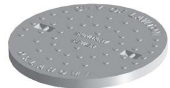
City Of Lawton