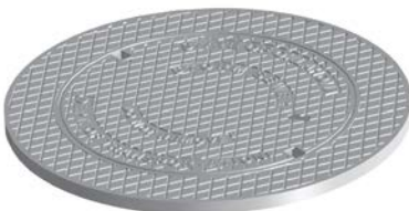
State Of Oklahoma