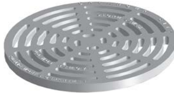
Type M Grate Oklahoma City Storm Approx. 205 sq. in. open area