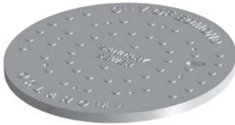
City Of Edmond